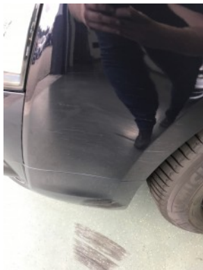
Front left screen - Scratch