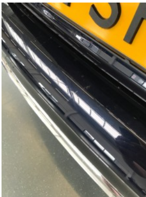
Rear bumper - Paint repair