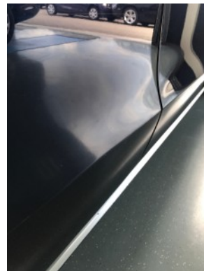
Rear right door - Dent